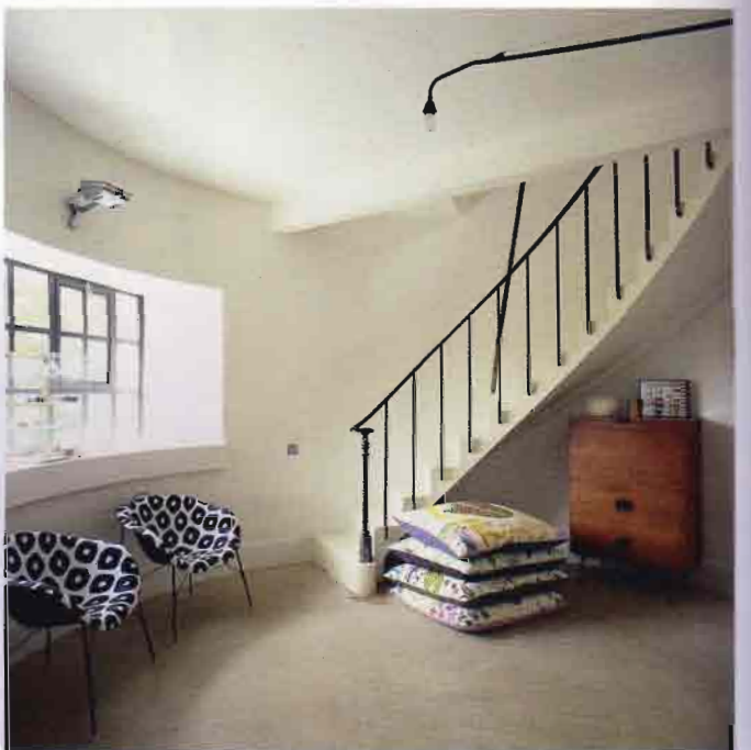
This page, clockwise from top left: in the dining room the Ercol stacking chairs are from Retrouvius; the lighthouse was transformed with steel-framed windows; in the sitting room are chairs by Paola Navone for Merci, and a case containing British butterflies perches atop a 1950s teak cupboard by Cees Braakman for Pastoe. The original lightning conductor can be seen beyond the banister; an extension, clad in grey oiled timber, allows for some lateral living space. Opposite: a piece by shell artist Blott Kerr-Wilson hangs among sea fans and sea biscuits in the timber-boarded bathroom